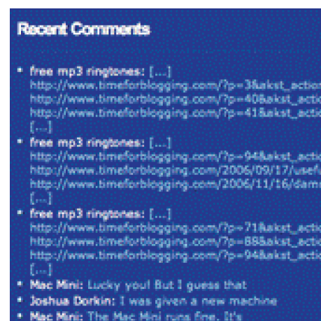
Figure 2. A comment spam

Spam 2.0 infiltrates through such "legitimate" websites by posting spam content on them. Figure 2, Figure 3, and Figure 4 illustrates few examples of Spam 2.0 in legitimate websites: blog comments, online communities and forum posts. This is the key differentiator between Spam 2.0 and other spam types (Hayati et al., 2010a). Spammers no