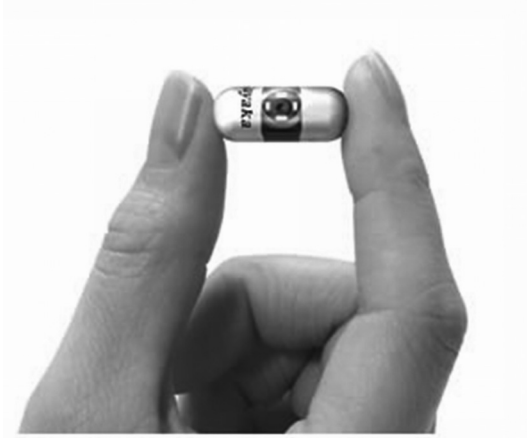
Figure 1. Capsule endoscope “Sayaka,” ©RF SYSTEM lab

robots require power supply wires and a permanent magnet. A potential problem with this design is that rotational drive could cause engulfment.