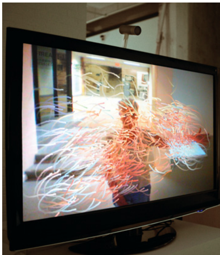
Figure 2. Stream and user interacting, located at http://www.collinhover.com/lab/stream/ .

Now if, after becoming familiar with the above project, I explained that I had several thousand creatures composed entirely of a drive to learn more about human body language and environment, as if curiosity might be considered a physical material, you may not find this so strange. I would also not think it out of place for you to make the most wild and outlandish movements with your limbs and body should you (and perhaps others) find yourself face to face with a group of these creatures. It seems difficult, when presented with a physical or digital system that exhibits sentience, for us humans, to resist exploring and interacting with it. This is the concept of