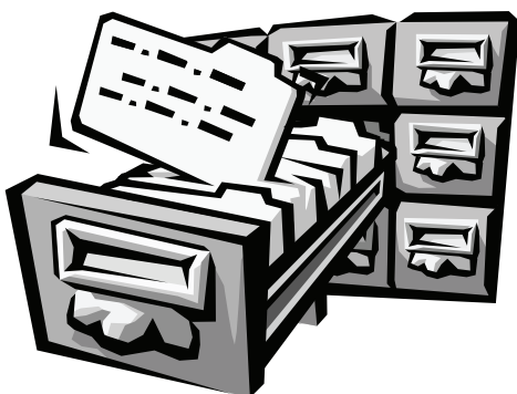
Figure 1. Filing cabinet vs. simple computerized system

Figure 1 shows the similarity between paper filing systems and simple computerized filing systems. To find a file in the paper system, an individual needs to know which file cabinet to search, which drawer to select, and which folder