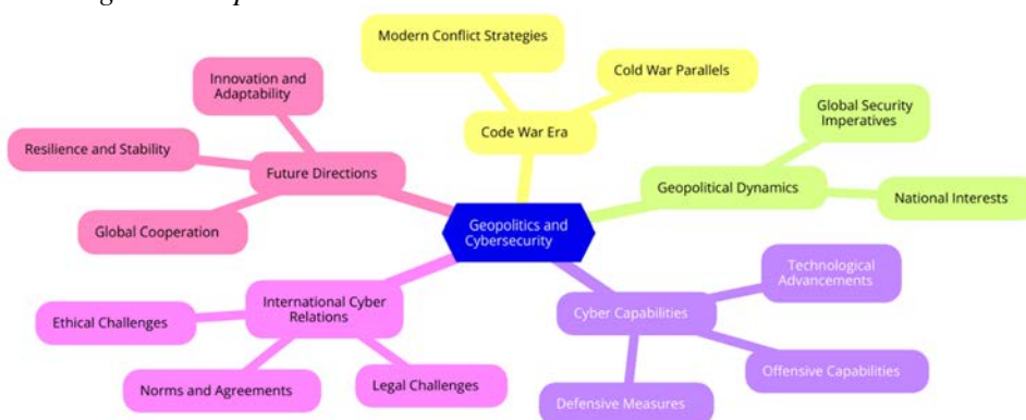
Figure 1. Mapping the intersection of geopolitics and cybersecurity: From code wars to global cooperation

Through a world where diplomacy and foreign relations play their leading roles in power politics and war, a new theatre of operations is gaining prominence — respected cyberspace. As the defending cyber realm, this phenomenon provides the basis for an investigation into the mutually interdependent security of nation-states, which lays the ground for an exploration of the evolution of the interconnected fields of cyber and geo-political security and the nature of their reciprocal relationship.