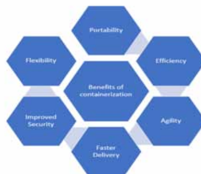
Figure 2. Benefits of containerization

Containerization can run the application in different programming languages with a single operating system. It works on the principle of the microservices model. The task can be divided and run on multiple containers and operate clusters for orchestrators using Kubernetes as per Yang (2023).