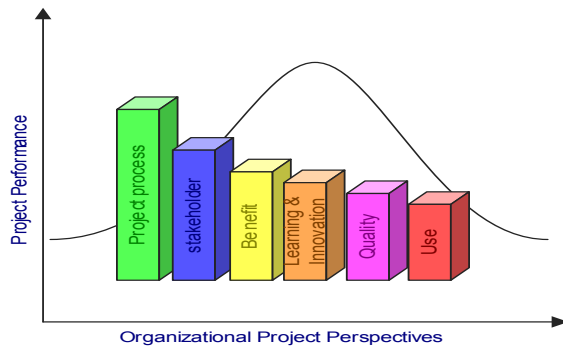
Figure 2. Project performance scorecard

A conceptualization of the six dimensions of the Project Performance Scorecard to depict the dynamism of the measurements based on the project and organizational context is shown (see Figure 2).