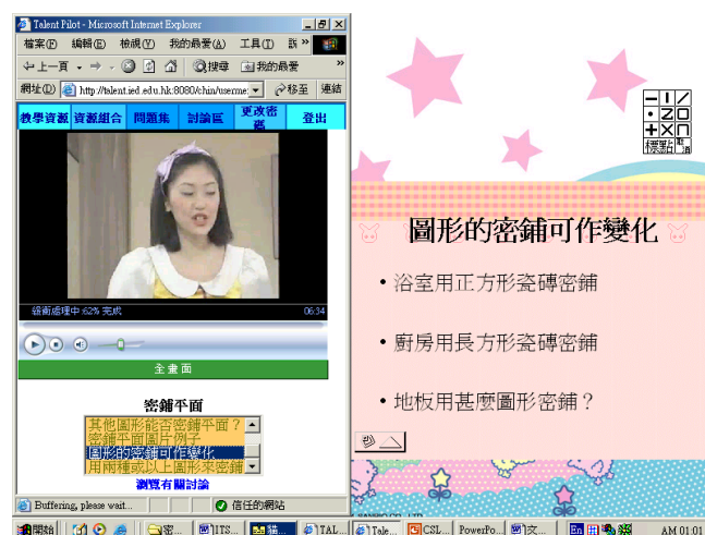
Figure 1. A presentation which is synchronized with video and PowerPoint file

Similarly, a user can create his/her own quiz or subscribe to another's quiz in the quiz section. The user can specify when the quiz will be displayed anytime