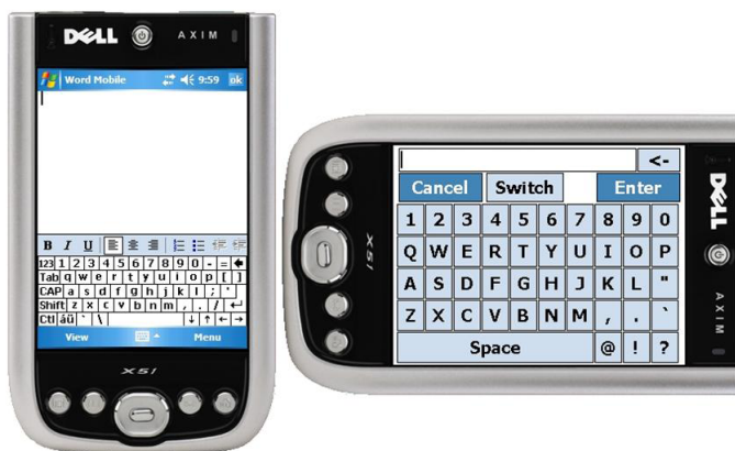
Figure 2. User interface design as part of the assistive technology research project