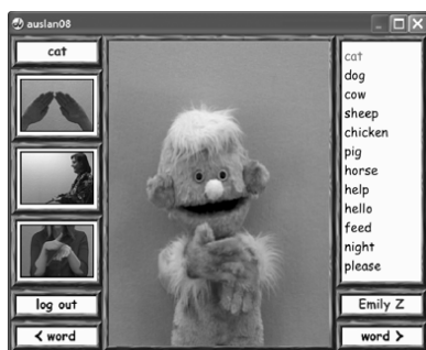
Figure 2. Story