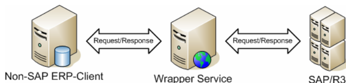
Figure 1. Communication between non-SAP systems and SAP/R3 Systems on the basis of Web Services