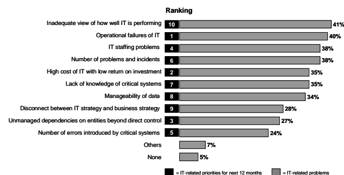
Figure 1. Problems and priorities of CEOs and CIOs (ITGI 2004)

How does management control influence the efficiency and effectiveness of IT organizations? Based on recent studies relating to management control and its impact on firm performance, we aim to understand and evaluate what type of and how much management control lead to overall performance improvements within an IT organization. Much of the management control literature (broadly defined) proposes new management control systems (e.g. activity-based costing, IT balanced