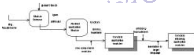
Figure 1: Overview of the RAISE model

The objective is that engineers can make reuse in all of development stages. We propose to introduce a RC model in all the development steps; in order to include abstraction, selection, specialization, and integration software artifacts in the RAISE method.