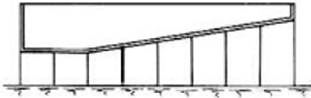
Figure 2. Tank slightly raised