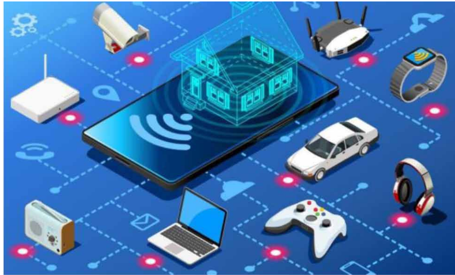
Figure 1. IoT Framework