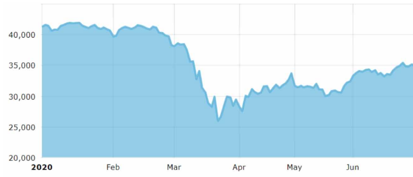
Figure 1. S&P BSE sensx (Source: S&P BSE Sensex, available at: https://www.bseindia.com/sensex/code/16/ )

the world's 2 nd most populous country. The widespread panic especially among the migrant workers was unparalleled. The expected national income and growth figures tumbled, along with the stock markets. The Indian economy fell by 9.6 percent in the last calendar year, due to the government as well as private containment efforts leading to a slump in domestic consumption (Business Standard, 2021). A quick view of the Indian stock market is presented in Figure 1, which shows most widely used index of the country i.e., Standard & Poor Bombay Stock Exchange (S&P BSE) Sensex. The stock index took a sharp fall in March 2020.