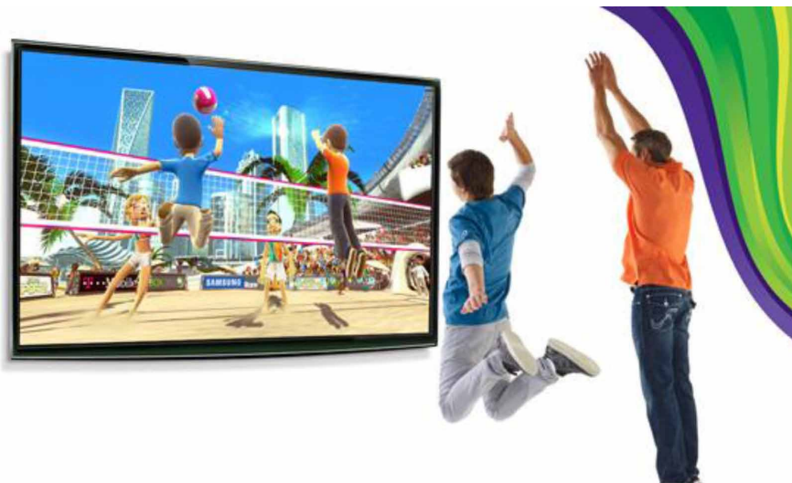
Figure 1. Intelligent application using Kinect