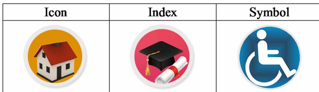
Table 1. Examples icon, index and symbol in e-governance websites