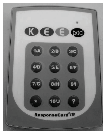
Figure 1. Credit-card size keypad

Draper and Brown (2004, p. 20) suggest that “The dream of personal teaching is really about adaptive teaching; where what is done depends on the learner’s current state of understanding.” ARS can provide timely feedback to support this adaptive teaching goal, but Draper and Brown make the point that this can only be achieved through ap-