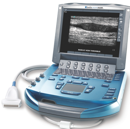
Figure 1. Portable echocardiogram machine (Sonosite MicroMaxx; Sonosite trademarks owned by SonoSite, Inc.)