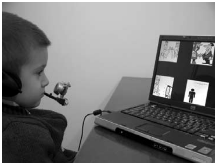
Figure 2. A normal child instrumented with the eye tracking system

A Genius® (KYE Systems Corp., Chung, Taipei Hsien, Taiwan, R.O.C.) Web cam was utilized and found suitable in terms of resolution, light sensitivity, and acceptable cost. The external packaging of the camera was redesigned, thereby substantially reducing its weight and volume, in order for it to be mounted on the patient's head. This alteration produced a headset consisting of a simple mechanical framework that separates the camera lens from the patient's eye by about five centimeters. The Web cam was connected to a notebook computer via a regular USB 2.0 port. The computer used in the development and testing of this system was a Toshiba Satellite™ M70-122 (Toshiba America, Inc., New York, NY, USA) notebook with a 1.73 GHz Centrino™ (Intel, Santa Clara, CA, USA) processor, 512 MB of RAM, and a 15 in. widescreen. Figure 2 shows a normal child instrumented with the eye tracking system.