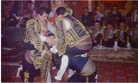
Figure 2. Examples of local plays performed in Yaren Talks