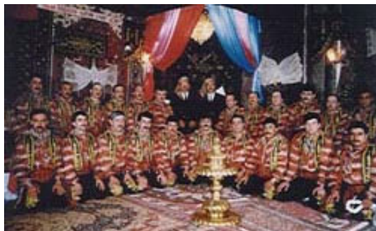
Figure 1. Yarens in the Yaren room

Requiring its members to be honest and honorable, the Yaren organization did not allow any unethical behavior. It functioned as an educational institution, especially for the young boys in the community. The Yaren Talks also provided recreation for the members, with special events that included, among other activities, folk music and dance performances and the serving of special cuisine. The Yaren successfully played its role as an important social institution through the centuries in the Ottoman Empire and Turkey.