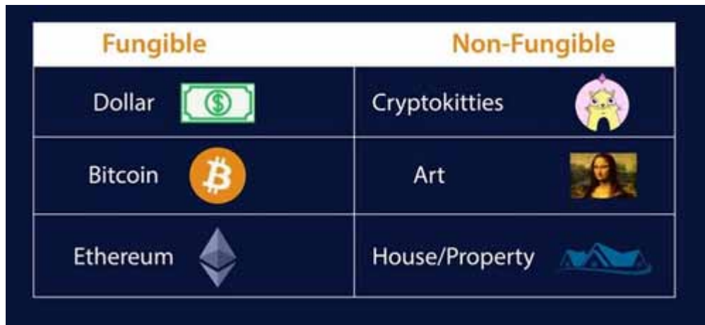
Figure 1. Examples of fungible and non-fungible tokens

By employing astute analyses and concrete illustrations, the chapter elucidates the capacity of NFTs to act as agents of transformative change in our understanding, valuation, and transaction of digital assets within the dynamic domain of Web3 technologies.