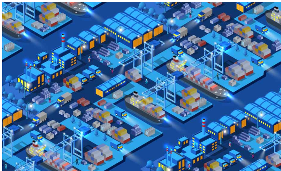
Figure 1. The changing landscape of transportation and warehousing industry (stormshield, 2023)

Within the supply chain, transportation and warehousing are inextricably linked. Transportation relies on warehousing for temporary storage, aggregation of goods, and efficient order picking, whereas