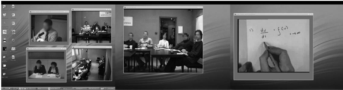
Figure 2. Multiple video streams of the access grid

used for the past fifteen to twenty years for communications between students and teachers.