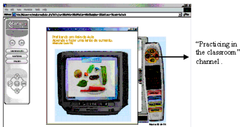
"Practicing in the classroom" screen – bodily-kinesthetic and naturalist intelligences < http://www.cederj.edu.br/cederj/ Retrieved September 26 th ,

naturalist intelligence as the student can build some instruments to study Nature. To access the internet sites that are recommended in the class, the student should click in the channel entitled "complementary reading" which, in agreement with Gardner, should stimulates the linguistic intelligence , the musical and the logical-mathematical intelligences too.