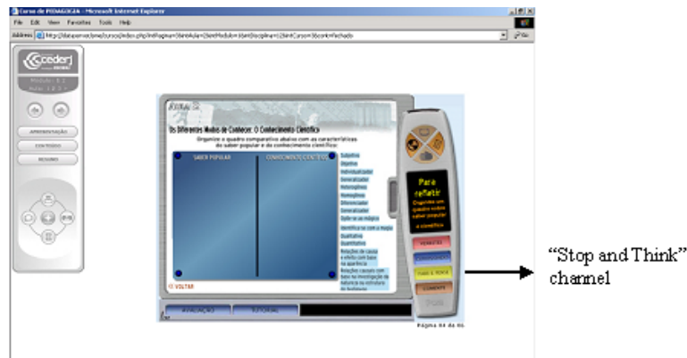
"Stop and Think" channel – Game - logical-mathematical intelligence < http://www.cederj.edu.br/cecierj/ Retrieved September 26 th , 2006