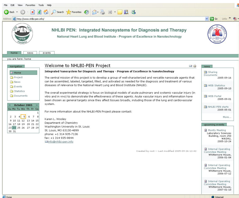
Figure 4. Web portal (home page view)

The E-Budget Tool keeps track of all the expenditures of each research group. This tool is available only to the Principal Investigator and her administration office. The budget of each research group is updated on a monthly basis and it shows the spent, the encumbrance and the available amounts. A color pie chart simplifies the visualization of the status of the budget and it is available in two formats. The first chart visualizes the research group budget situation by months, and it is used for monitoring the expenses over a long period of time. The second format gives an overview of all research groups by a selected month (Figure 3).