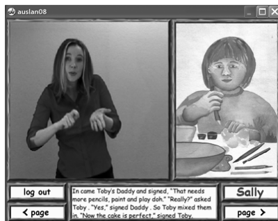
Figure 2. Story