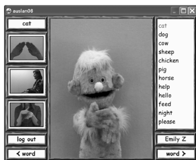
Figure 1. Direct instruction