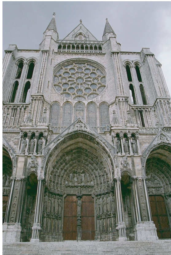
Figure 1. The Great Portal, Chartres Cathedral, France

A major user of portal technology around the world is governments and the public sector. A large research effort describes and discusses public sector, education and government portals, while social and community-based portals are not forgotten. At the personal portal level, research is conducted in topics including Weblogs, widgets and MP3 players. Medical, health and bio-informatics portals form another significant group of applications.