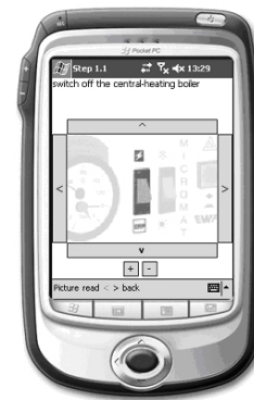
Figure 5. Screenshot of the GUI fragment corresponding to Figure 4