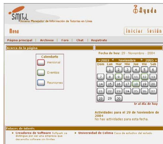
Figure 2. Student personal screen

Figures 3 and 4 show the Administrator System Calendar and the Assignment and Resource Management Console, respectively. The system administrator can program meetings with individual or specific groups CTs or students as well add or eliminate students or CTs. The system administrator can change CT-student assignments, which were previously determined alphabetically and numerically by default. The