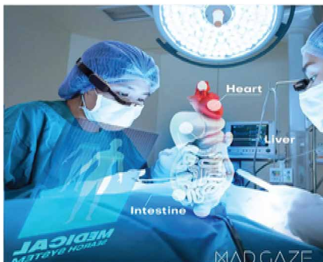
Figure 1. Head-mounted displays surgery