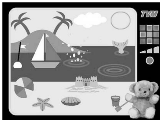
Figure 1: A screen shot of the "TVM" Peekaboo

Drill activities have a regimented starting and finishing point and often reward successful completion. The advantage of drill activities is that they are often easy to access, can be engaging and can develop