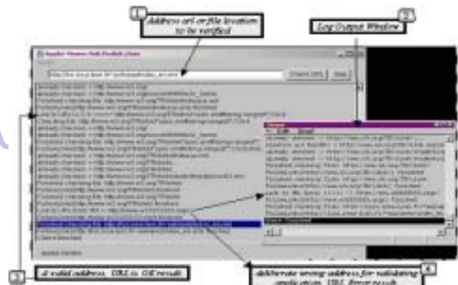
Figure 3: Running application

The next figure depicts the parts of running application. The input field takes the url or file location to be verified i.e. URL: http://lisi.insa-lyon.fr/~aalvarez/document_a.xml. (1); The Output window shows the status of each link and the links contained in the same document (2), when the link address is valid, an Ok message is displayed.