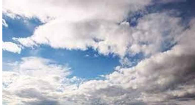
Figure 1. Atmosphere