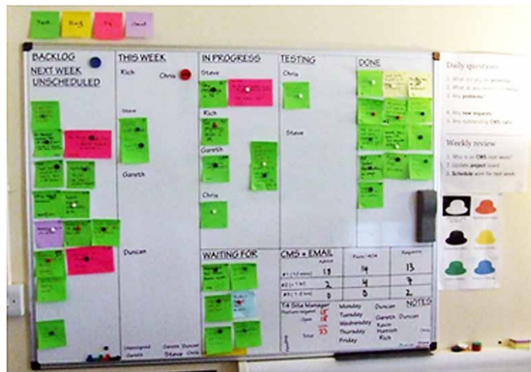
Figure 1. Example of VM panel

Moreover, the information can be displayed in various formats (figures 1, 2): tables, charts, panel data, banners, posters, electronic media (if using computer networks), etc.