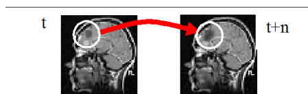
Figure 2. Tumor growth inside the brain

The rest of this article is organized as follows: the next section is devoted to detail the related work. In the following section, we define our method of computing the different relations and we show how image indexing can be done. The subsequent section demonstrates how our method can adequately index medical images. Finally, we conclude and give future work orientations.