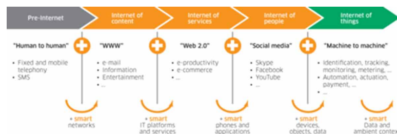
Figure 1. Evolution of IoT

As shown in Figure 1 that is how the Internet of Things actually evolved with the advent of time. At the era of pre-internet, which is also known as “H2H” or “Human-to-Human” era, people had the fixed or mobile telephony. Except that one of the primary ways of communication was through SMS services. After that with the incorporation of smart networks when the internet came into existence, the “www” or “world wide web” era the communication as well as information and entertainment etc. gets better through the internet. Furthermore, smart IT platforms and services were added to “www” that results in “web 2.0” era that totally converts everything into digital transformation like e-productivity, e-commerce, etc.