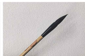
Chinese brush

From Hair-brush referred to Qin Dynasty ( circa B. C. 240). It is the earliest brush and preserved in the Museum of Hunan province, China.