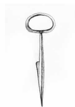
Metal stylus Drawing by Jingying Zhen

From bronze stylus referred to Zhou Dynasty (circa B. C. 500).