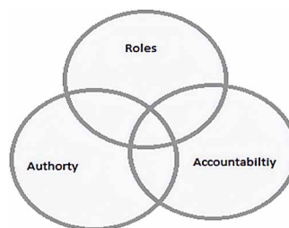
Figure 1. Digital governance

There are some good reasons to believe that transition towards an effective digital governance framework can be achieved by capacity building of government departments. The impact of transition is more evident when there is motivations and imperatives for adopting digital governance. To achieve success evaluation controls and strict monitoring system can also be employed in absence of capabilities and