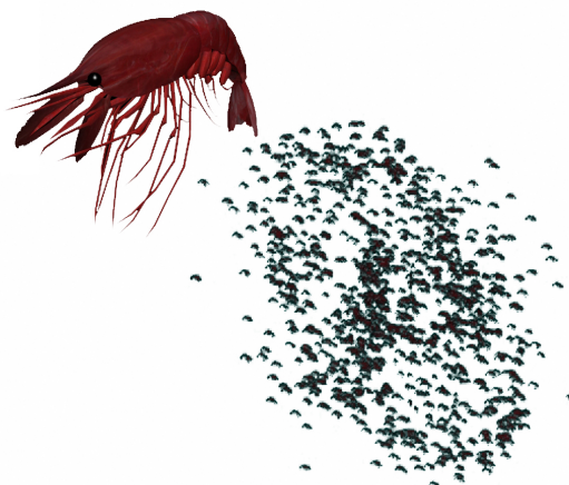
Figure 2. 3D krill and sample 3D swarm

Working with marine biologists, a 3D model of large numbers of swarming krill (Figure 2) has been created. The model augments the classic swarming functions of separation, alignment and cohesion outlined by Reynolds (1987). The generated 3D model allows cameras to be placed on individual krill in order to generate an in-swarm perspective. New research on Antarctic krill (Tarling & Johnson, 2006) reveals that they absorb and transfer more carbon from the Earth's surface than was previously understood. Scientists from the British Antarctic Survey (BAS) and Scarborough Centre of Coastal Studies at the University of Hull discovered that rather than doing so once per 24 hours, Antarctic krill 'parachute' from the ocean surface to deeper layers several times during the night. In the process they inject more carbon into the deep sea when they excrete their waste than had previously been understood. Our objective has been to provide marine biologists with a visualisation and statistical tool that permits them to change a number of parameters within the krill marine environment and examine the effects of those changes over time. The software can also be used as a teaching tool for the classroom at varying academic levels.